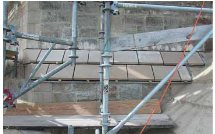
Precast stone replacement in progress

EDI has completed the bid process for Phase 2. This work will complete the stone replacement and masonry joint repairs on the upper portion of the church and along the south stained glass wall of the nave. The flat roof on the south side of the church will also