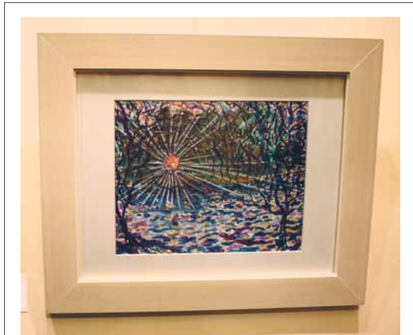
'The Artist's Eye'