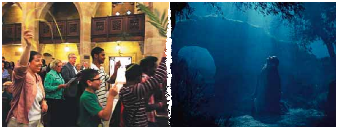
Celebration and Passion—Two of the highlights on Palm Sunday