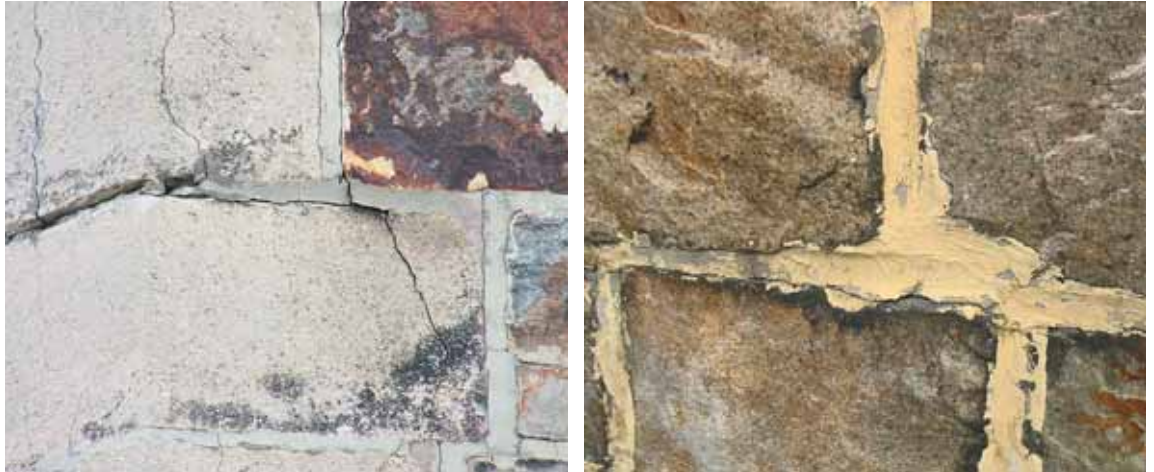
Examples of masonry joints requiring repairs

The EDI investigation discovered that the level of needed exterior stone and masonry joint repairs was much more extensive than was reflected in the original Technical Assurance report. Based on this enhanced understanding of the primary source of water infiltration revealed by the EDI investigation,