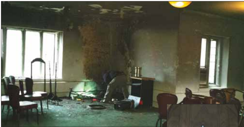
ABOVE: Yoder Room corner; RIGHT: Sanctuary