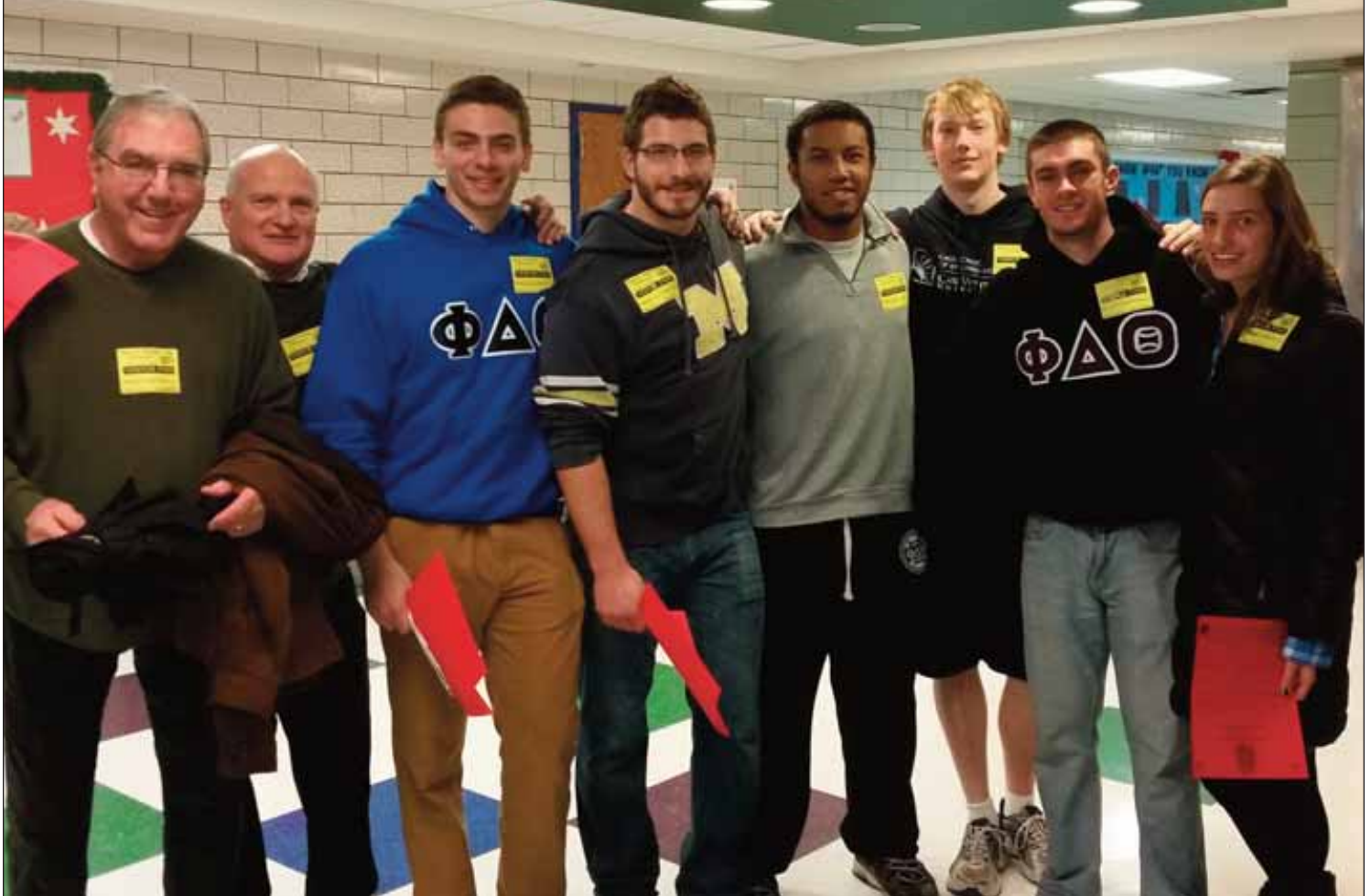
Several of the church's "Christmas Elves" who delivered books to each child in Mary B. Martin School in December.

After a stop at the Potato Bar in our Great Hall, please take advantage of this opportunity to learn more about how you might participate in the important activities that are happening in our church and beyond.